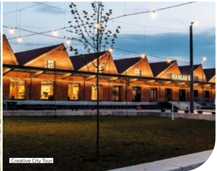
Creative City Tour