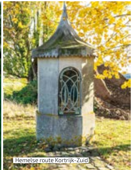
Hemelse route Kortrijk-Zuid