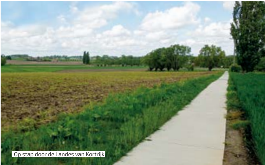
Op stap door de Landes van Kortrijk