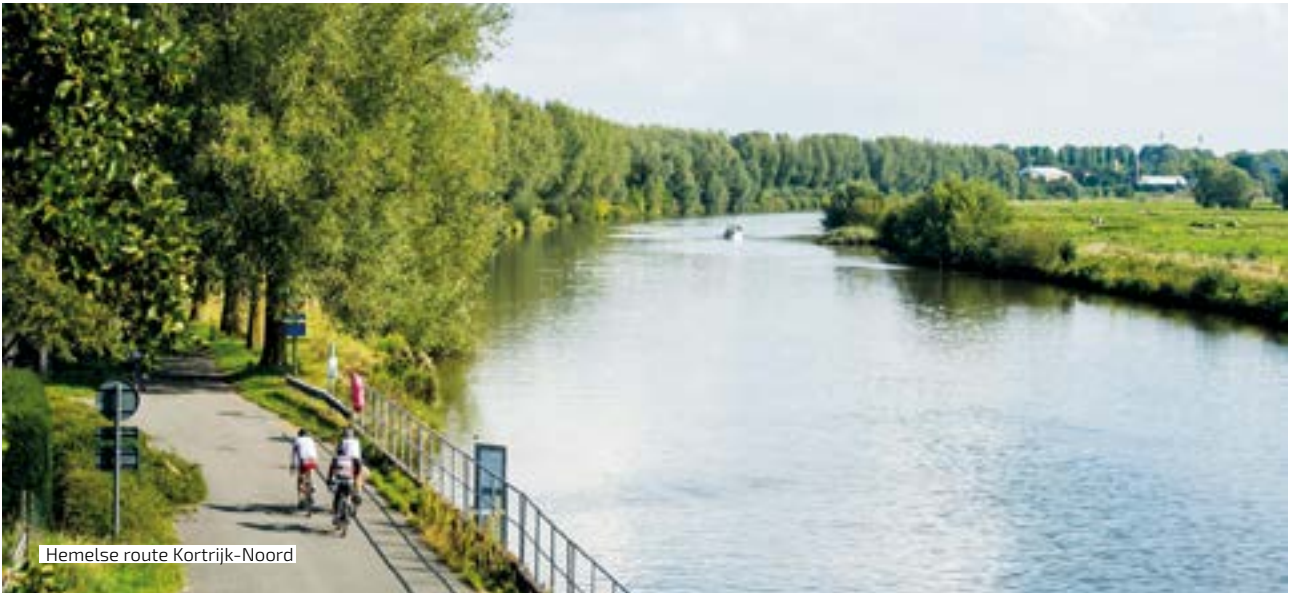
Hemelse route Kortrijk-Noord